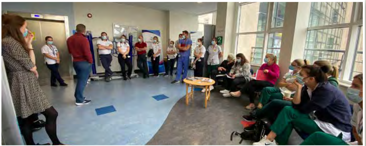
Annual Falls Prevention Day