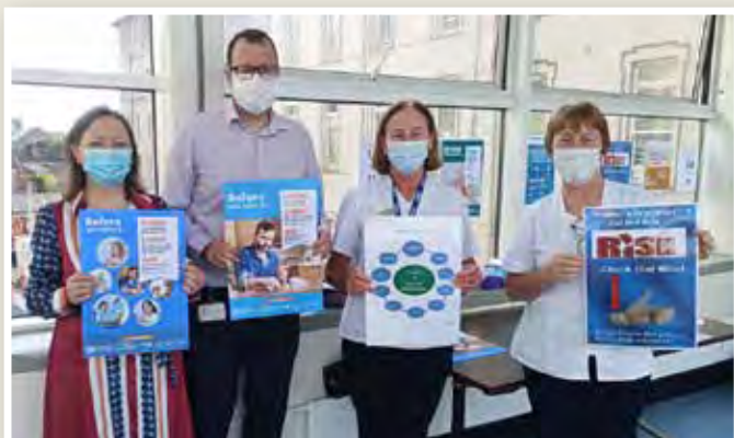
World Patient Safety Day