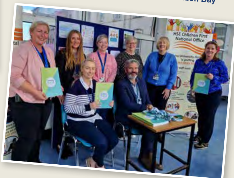
Children's First Awareness Week