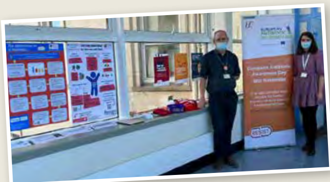
European Antimicrobial Awareness Day