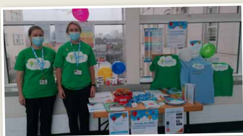
World COPD Day