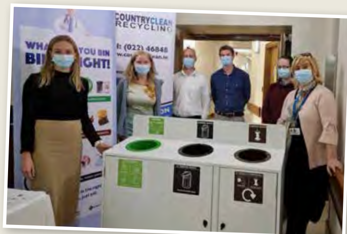
Waste Awareness Day