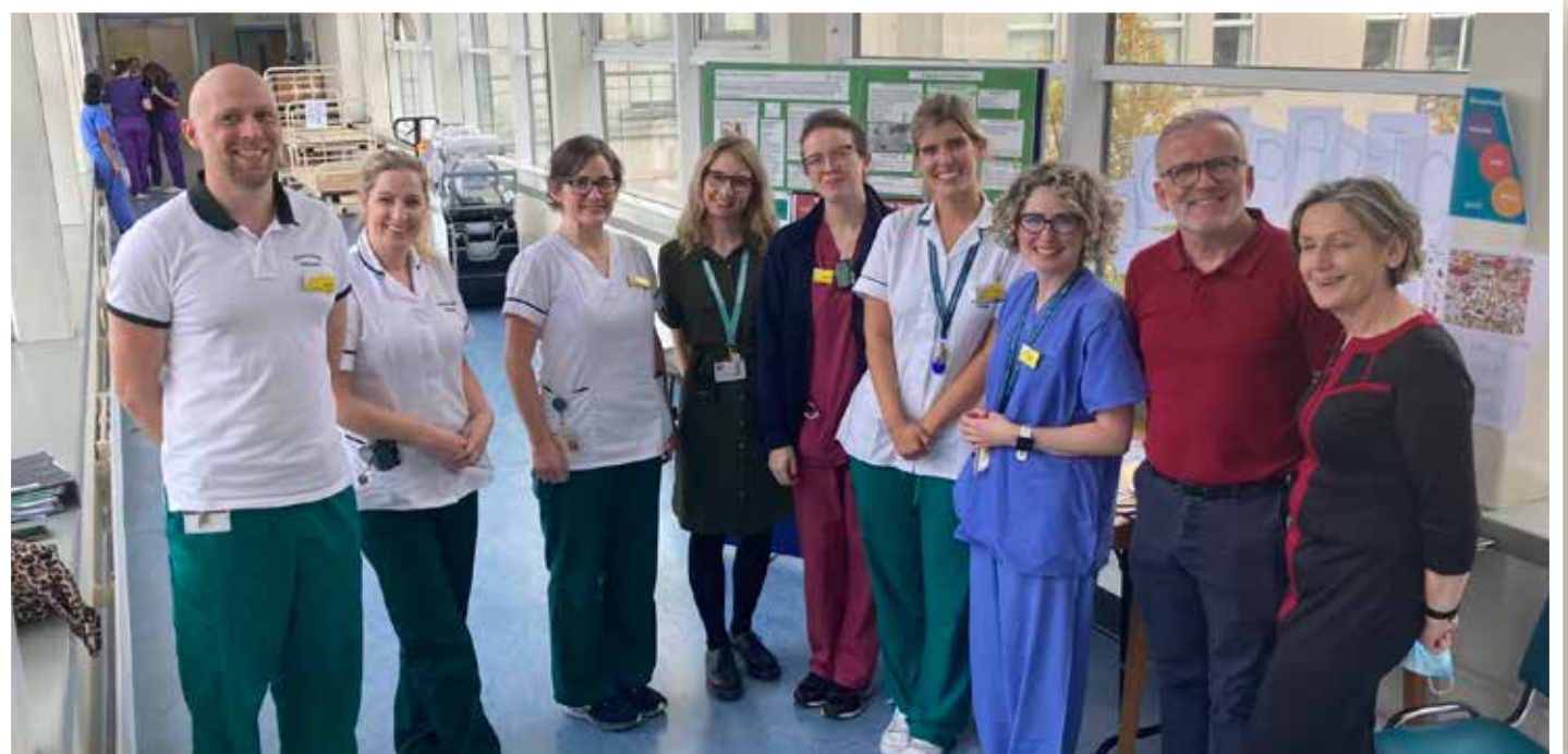
Occupational Therapy Week