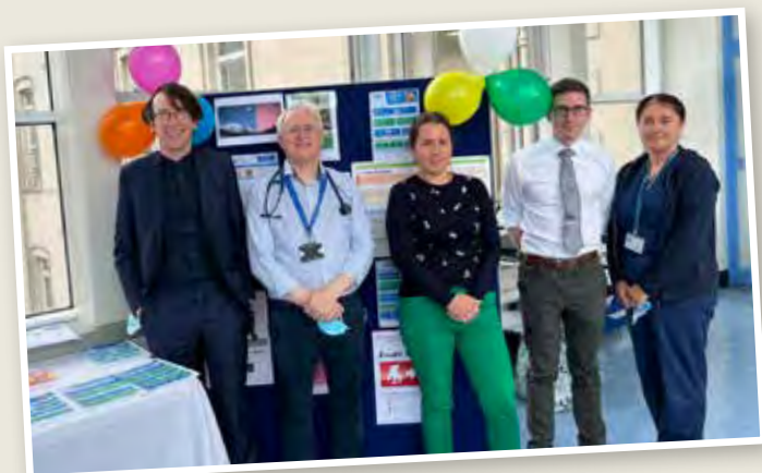
Positive Ageing Week