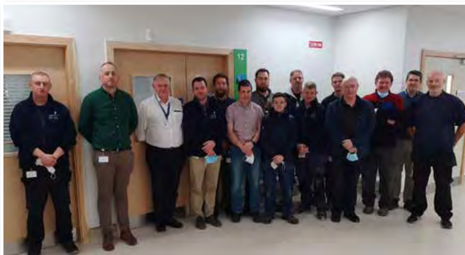
Technical Services Department

Patient information leaflets giving some background of the project and ongoing works were introduced on this project and worked well from an information sharing perspective. Monthly progress updates were shared with staff to keep everyone up to speed on how the project was progressing.