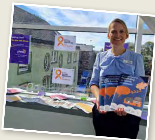
World Suicide Prevention Day