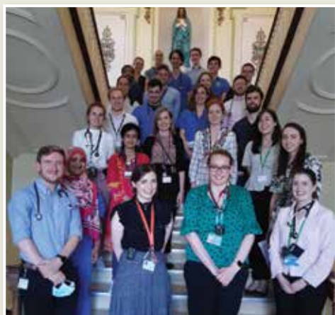
Medicine and Oncology Group