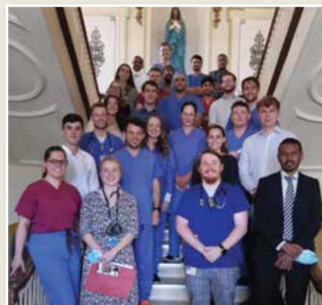
Surgery and Anaesthetics Group