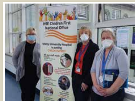
International Social Work Day