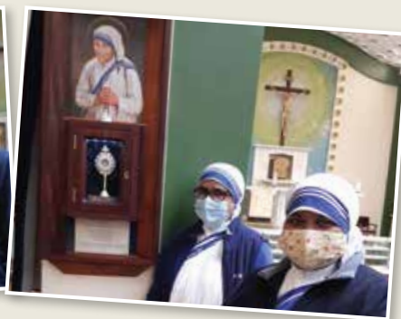
Missionary of Charity Sisters