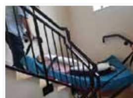
Staff learning how to manoeuvre around a stair using the mattress and ski-sheet.