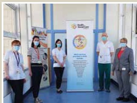
National HSCP Day