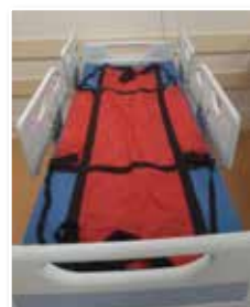
A typical ski-sheet that can be used for rapid evacuation.

If you would like to put your name forward for this training, please do not hesitate to reach out the MUH Fire Safety Officer on kharris@muh.ie who will be delighted to assist you and help you get placed on the next available training session.