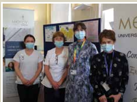
International Nurses Day 2021

Annual days to celebrate and acknowledge specialities, professions and practices at MUH are core to recognising the contribution of all staff and highlight the key work being undertaken. Over the last few months MUH has celebrated: