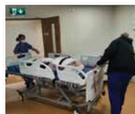
MUH staff members working as a team to simulate progressive horizontal evacuation.